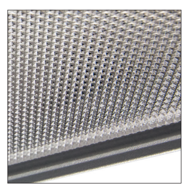
MP19H microprismatic diffusor